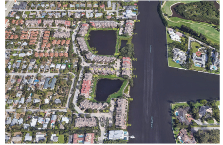
Built in 2004 - 104 units - 3 floors

The Estuary at Delray Beach c/o Associated Property Management of the Palm Beaches, Inc. 8135 Lake Worth Road, Suite B, Lake Worth, FL 33467 Office: (561) 588-7210 Fax: (561) 588-2411