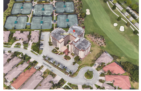
Built in 1986 - 36 units - 7 floors

Gleneagles Country Club Address: 7667 Victory Ln, Delray Beach, FL 33446 Phone: +1 561-498-3606 https://www.gleneagles.cc/default.aspx?p=dynamicmodule&pageid=133&ssid=100125&vn