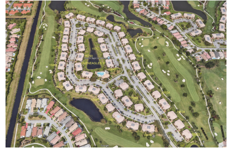
Built in 1987 - 258 units - 3 floors

Gleneagles Country Club Address: 7667 Victory Ln, Delray Beach, FL 33446 Phone: +1 561-498-3606 https://www.gleneagles.cc/default.aspx?p=dynamicmodule&pageid=133&ssid=100125&vn