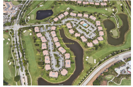
Built in 1987 - 160 units - 3 floors

https://www.gleneagles.cc/default.aspx?p=dynamicmodule&pageid=133&ssid=100125&vn