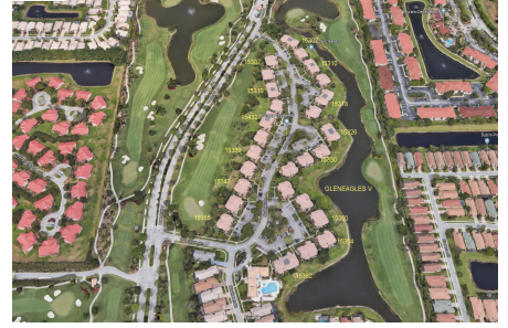
Built in 1988 - 132 units - 3 floors

Gleneagles Country Club Address: 7667 Victory Ln, Delray Beach, FL 33446 Phone: +1 561-498-3606 https://www.gleneagles.cc/default.aspx?p=dynamicmodule&pageid=133&ssid=100125&vn