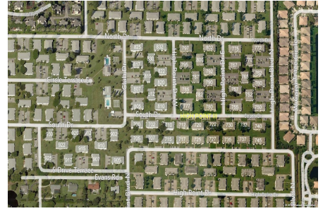
Built in 1973 - 248 units - 1 floor

High Point Condominium Assoc 3 West 5185 Nesting Way Delray Beach, FL 33484-1762 (561) 496-0361