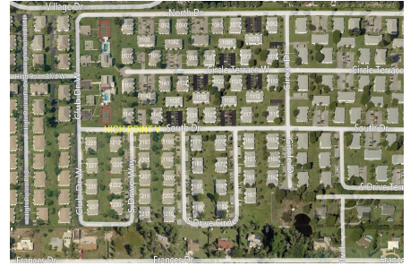
Built in 1977 - 268 units - 1 floor

High Point of Delray Section 5 Condo Assoc Inc 1103 Club Dr W Delray Beach, FL 33445 (561) 495-7866 http://www.highpointfive.com/