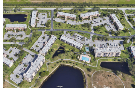
Built in 1983/1985 - 352 units - 8 floors

Huntington Lakes Inc Address: 7355 Huntington Ln, Delray Beach, FL 33446 Phone: +1 561-498-0228 https://hlidelray.com/