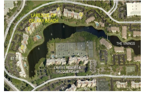
Built in 1984 - 212 units - 5 floors

Lakeside of Delray Beach 1915 Lavers Circle Suite E-106 Delray Beach FL 33444 (561) 278-8558 http://lakeside-delraybeach.com/