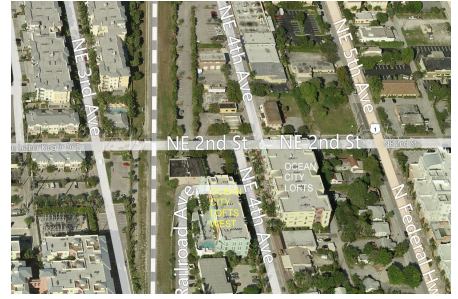
Built in 2005 - 27 units - 4 floors