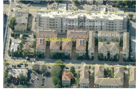
Built in 2006 - 20 units - 3 floors

AI Porta Mare LLC 151 NE 5th Avenue Delray Beach, FL33483-5416 (561) 330-2773