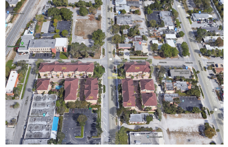
Built in 2004 - 32 units - 3 floors

San Sebastian Homeowners Association, Inc 100 East Linton Boulevard # 205 Delray Beach, FL 33483 (561) 362-7444