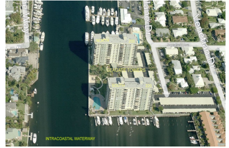
Built in 1970 - 147 units - 13 floors

Seagate Towers Condominium Complex Address: 220 Macfarlane Dr, Delray Beach, FL 33483 Phone:(561) 278-3297 http://seagatetowers.org/