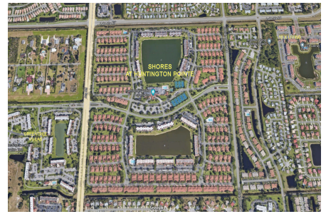
Built in 1989/1992 - 520 units 1 floor

Huntington Pointe Association Inc 6251 North Oriole Boulevard Delray Beach, FL 33484 (561) 496-3801 https://huntingtonpointe.net/