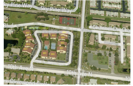
Built in 1985 - 96 units - 2 floors