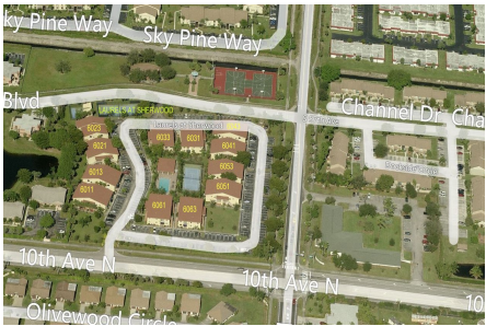
Built in 1985 - 96 units - 2 floors