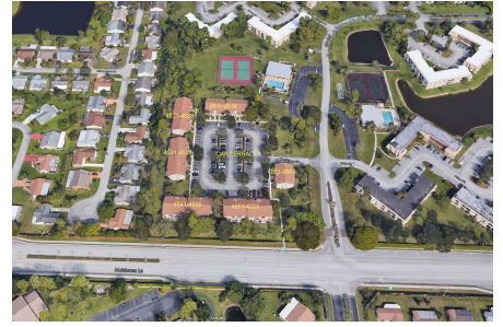
Built in 2004 - 44 units - 2 floors

Number of units: 44 Number of active listings for rent: 1 Number of active listings for sale: 0 Building inventory for sale: Number of sales over the last 12 months: 0% Number of sales over the last 6 months: 1 Number of sales over the last 3 months: 1