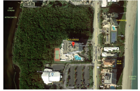
Built in 1986 - 54 units - 11 floors

Casuarina Condominiums Address: 3450 S Ocean Blvd, Highland Beach, FL 33487 Phone: +1 561-278-3441