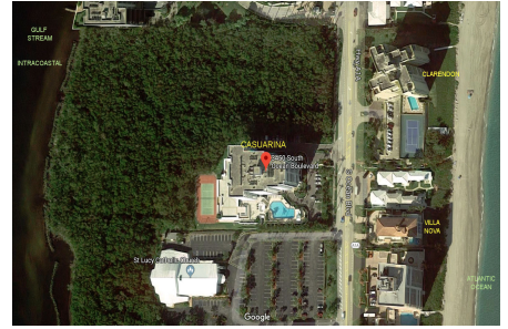
Built in 1986 - 54 units - 11 floors

Casuarina Condominiums Address: 3450 S Ocean Blvd, Highland Beach, FL 33487 Phone: +1 561-278-3441