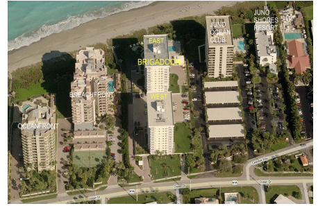
Built in 1977 - 94 units - 12 floors

Brigadoon Condominium 500 Ocean Drive Juno Beach, FL33408 (561) 626-9893 BrigadoonOffice@yahoo.com http://www.brigadooncondo.com/home.asp