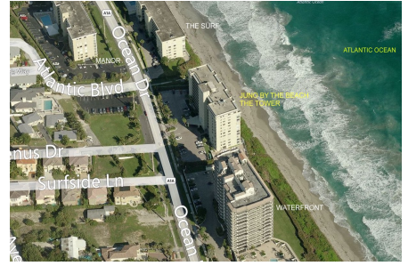
Built in 1973 - 70 units - 12 floors

Juno Beach Tower 840 Ocean Drive, Juno Beach, FL 33408 Office 561-626-0043 http://junobeachtower.com/