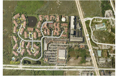
Built in 1985 - 144 units - 2 floors

Sea Oats of Juno Beach Property Owners Association 800 Sea Oats Dr Juno Beach, FL 33408 (561) 624-2956