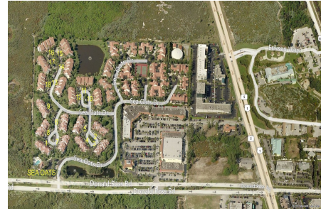
Built in 1985 - 144 units - 2 floors

Sea Oats of Juno Beach Property Owners Association 800 Sea Oats Dr Juno Beach, FL 33408 (561) 624-2956