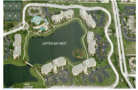
Built in 1986 - 192 units - 4 floors

Jupiter Bay Condominium Association 275 Palm Ave, Jupiter, FL 33477 (561) 746-5857 http://www.jupiterbaycondoassoc.com/id63.html