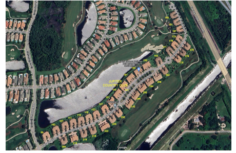
Built in 2008/2019 - 149 units - 1 floor

Jupiter Country Club HOA 280 Cortona Blvd Jupiter, FL 33478 Phone: 561-529-3436