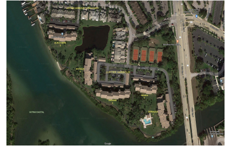
Built in 1981 - 97 units - 5 floors