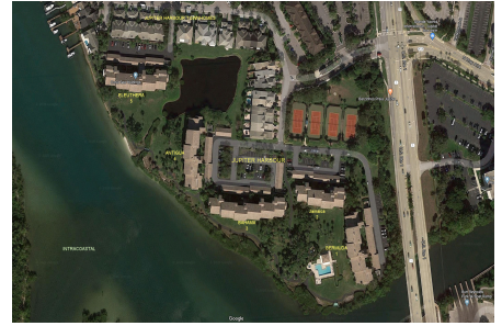
Built in 1981 - 97 units - 5 floors