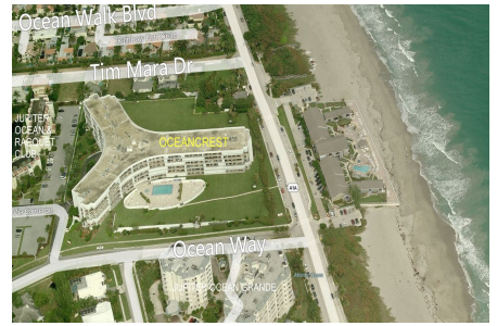
Built in 1982 - 161 units - 6 floors

Ocean Crest Condominium Apartments Inc 1300 S Highway A1A # 100 Jupiter, FL 33477 Phone: (561) 747-4776