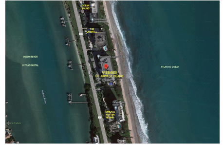
Built in 1982 - 39 units -

Passages of Jupiter Island Inc Address: 19750 S Beach Rd, Jupiter, FL 33469 Phone: +1 561-746-1704 https://passages19750.com/