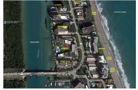
Built in 1977 - 35 units - 2 floors

Seamist condo association seamisttequesta@gmail.com https://seamisttequesta.org/