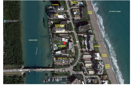
Built in 1977 - 35 units - 2 floors

Seamist condo association seamisttequesta@gmail.com https://seamisttequesta.org/