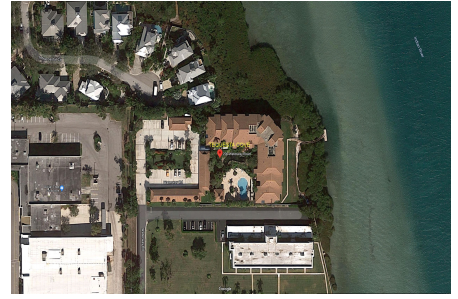
Built in 1985 - 24 units - 3 floors

Tequesta Cove Condominium Association, Inc 200 Waterway Road Jupiter, FL 33469 (561) 744-1493