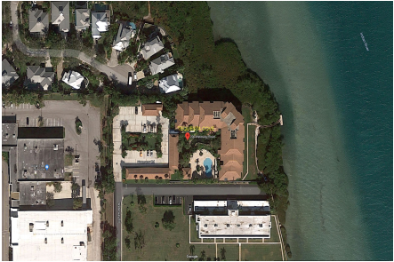
Built in 1985 - 24 units - 3 floors

Tequesta Cove Condominium Association, Inc 200 Waterway Road Jupiter, FL 33469 (561) 744-1493