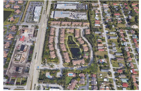
Built in 2008 - 94 units - 2 floors