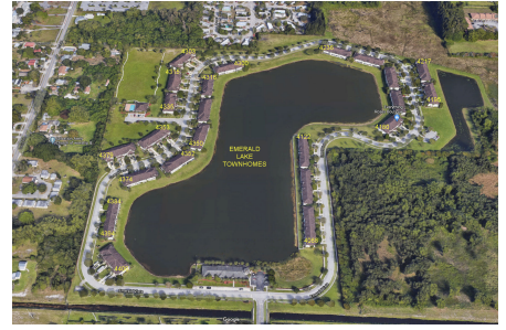
Built in 2006 - 135 units - 2 floors

Emerald Lake Townhomes c/o GRS Community Management 3900 Woodlake Blvd. Suite 309 Lake Worth, FL 33463 TEL: 561-641-8554 FAX: 561-641-9448 https://www.grsmgt.com/association/emerald-lakes/