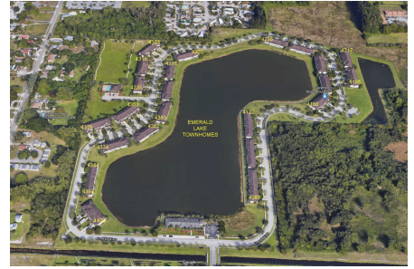
Built in 2006 - 135 units - 2 floors

Emerald Lake Townhomes c/o GRS Community Management 3900 Woodlake Blvd. Suite 309 Lake Worth, FL 33463 TEL: 561-641-8554 FAX: 561-641-9448 https://www.grsmgt.com/association/emerald-lakes/