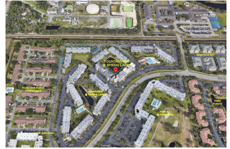
Built in 1990 - 64 units 4 floors

https://www.cmcmanagement.biz/the-grandview.html