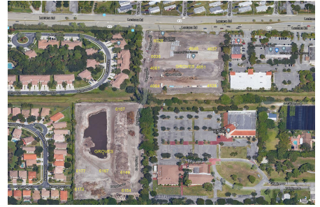
Built in 2018 - 63 units - 2 floors