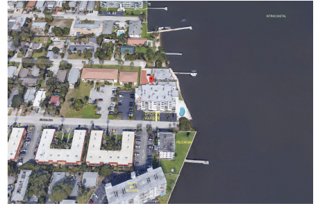
Built in 1974 - 34 units - 5 floors

Croton Harbor Condominium 301 Croton Avenue Apartment 404 Lantana, FL 33462