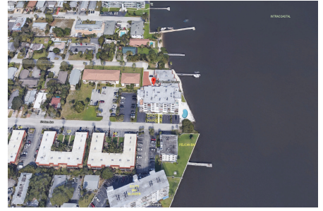
Built in 1974 - 34 units - 5 floors

Croton Harbor Condominium 301 Croton Avenue Apartment 404 Lantana, FL 33462