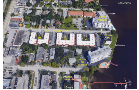
Built in 1977 - 66 units - 2 floors