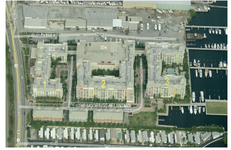
Built in 2006 - 136 units - 6 floors

Number of units: 136 Number of active listings for rent: 3 Number of active listings for sale: 9 Building inventory for sale: 6% Number of sales over the last 12 months: 7 Number of sales over the last 6 months: 4 Number of sales over the last 3 months: 2