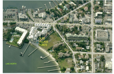
Built in 2006 - 26 units - 4 floors