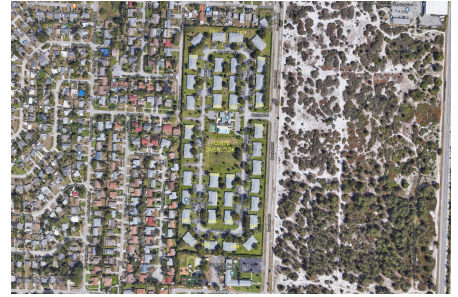
Built in 1974 - 148 units - 1 floor

Pointe Overlook Condo Association Inc 7275 East Oakridge Circle Lantana, FL 33462 (561) 586-0477