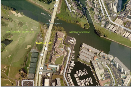
Built in 1981 - 108 units - 4 floors

Marina Bay Condo Association, 1030 Us Highway 1 North Palm Beach, FL 33408 Phone: (561) 626-2800