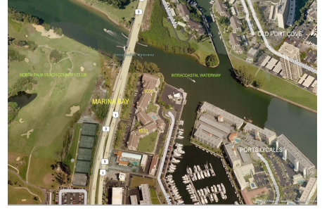
Built in 1981 - 108 units - 4 floors

Marina Bay Condo Association, 1030 Us Highway 1 North Palm Beach, FL 33408 Phone: (561) 626-2800