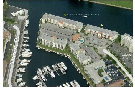
Built in 1980 - 171 units - 5 floors

Ports O'Call Condominium Association 24 Yacht Club Dr, North Palm Beach, FL 33408 (561) 626-4500