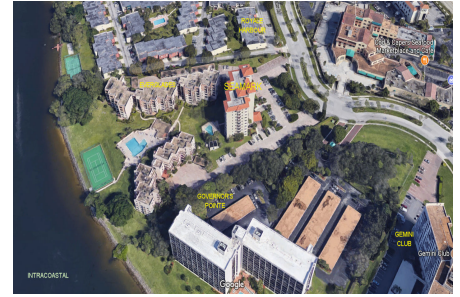
Built in 2003 - 39 units - 10 floors

Seamark Condominiums Address: 370 Golfview Rd, North Palm Beach, FL 33408 Phone: +1 561-622-2030