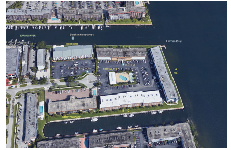
Built in 1967 - 87 units in total - 3 floors

Shore Club B Address: 110 Shore Ct, North Palm Beach, FL 33408 Phone: +1 561-881-0464 Shore Club C Condominium Association, Inc 111 Shore Court North Palm Beach, FL 33408 Phone: (561) 881-7979