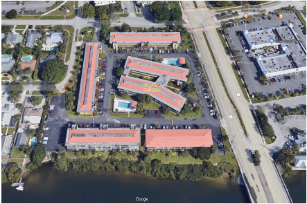
Built in 1968 - 116 units - 3 floors

Village Garden Condo Association Address: 419 US-1, North Palm Beach, FL 33408 Phone: +1 561-844-6818