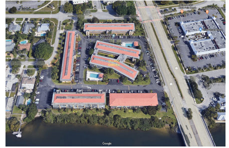
Built in 1968 - 116 units - 3 floors

Village Garden Condo Association Address: 419 US-1, North Palm Beach, FL 33408 Phone: +1 561-844-6818