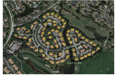
Built in 1983 - 340 units - 2 floors

Golf Villas community management SEACREST SERVICES, INC. 2400 Centrepark W. Drive, Ste. 175 West Palm Beach, FL 33409 561-697-4990 lbrennan@seacrestservices.com http://golfvillasatpganational.com/