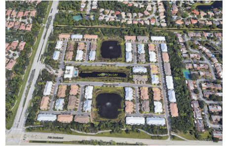
Built in 2014 - 192 units - 2 floors