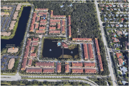
Built in 2005 - 317 units - 3 floors

Harbour Oaks HOA Address: 2500 San Pietro Cir, West Palm Beach, FL 33410 Phone: +1 561-622-6949