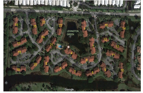
Built in 1986 - 192 units - 2 floors

Lexington Green Condo Assn 300 Avenue Of Champions Palm Beach Gardens, FL 33418 Phone: (954) 924-3071