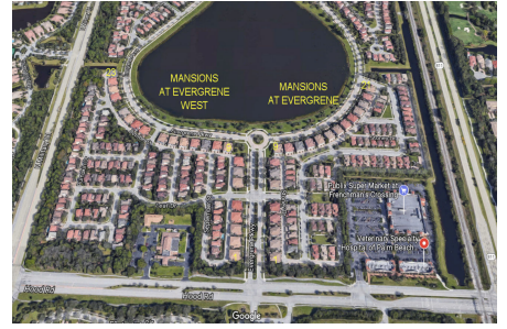
Built in 2002 - 63 units - 2 floors