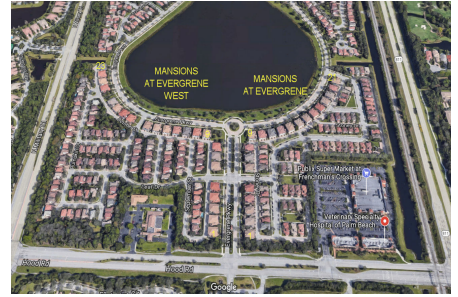
Built in 2002 - 63 units - 2 floors