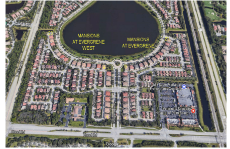
Built in 2004 - 68 units - 2 floors