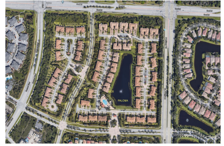
Built in 2007/2013 - 196 units - 2 floors