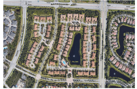
Built in 2007/2013 - 196 units - 2 floors

Paloma Campbell Property Management jupiter@campbellproperty.com 401 Maplewood Dr. Suite 23 Jupiter, FL 33458 Phone: 561-203-7910 Fax: 561-277-2481 http://mypalomahoa.com/paloma/home.asp