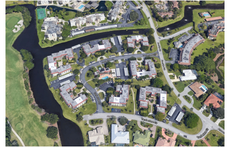
Built in 1967 - 136 units - 3 floors

Tamberlane Condominium Association Complete Property Management 3307 Northlake Blvd Suite 107 Palm Beach Gardens, FL33403 561-626-2778 Office and Contact Info 561-622-1766 561-622-1801 FAX https://www.tamberlanecondospbg.com/