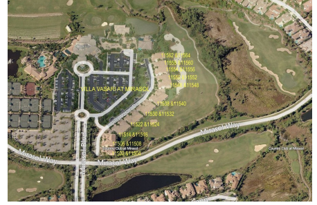
Built in 2005 - 32 units - 2 floors

VILLA VASARI AT MIRASOL CONDOMINIUM ASSOCIATION, INC. LANG MANAGEMENT COMPANY INC 21045 COMMERCIAL TRAIL BOCA RATON FL 33486 PHONE 561-750-8800 FAX 561-750-4528